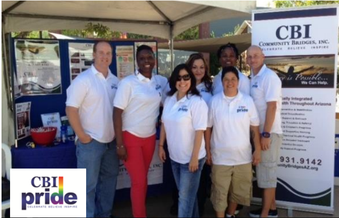
CBI's LGBTQ committee was proudly represented at the Phoenix PRIDE Rainbows Festival on October 19 th & 20 th at Heritage Park in Phoenix.